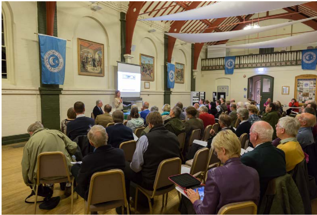
ARK AGM in Hungerford Corn Exchange