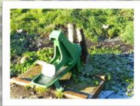
Pasture pumps installed