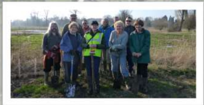
Hedge planted by volunteers