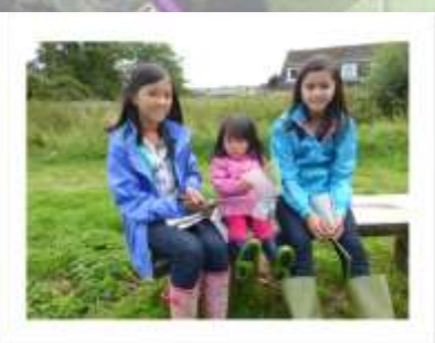
New seats installed