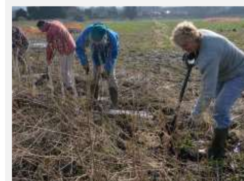
Volunteers planting new hedge

Action: MTC to source appropriate replacement litter/dog mess bins by end of 2015. MTC to empty bins twice a week during May, June, July, August and once a week through the rest of the year. ARK/MTC to continue 'Bag it and Bin it' and 'Bin it don't Sling it' campaigns. ARK volunteers to litter pick during summer months and liaise with Grounds and Estates manager to arrange for removal of additional waste. (Appendix 4—Bag it and Bin it posters).