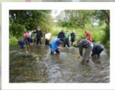
Stream water crowfoot planted by scouts and now established