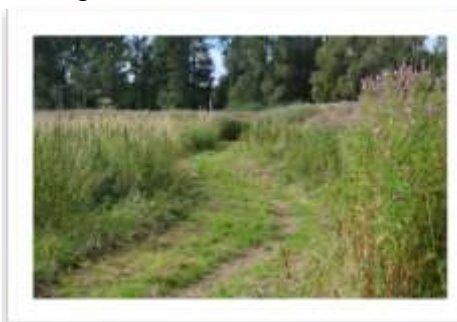
Example of sinuous path