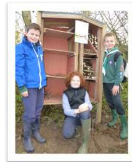
Local cubs and scouts building a bug palace