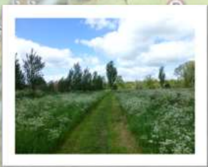
Foot paths mown and maintained by Marlborough Town Council