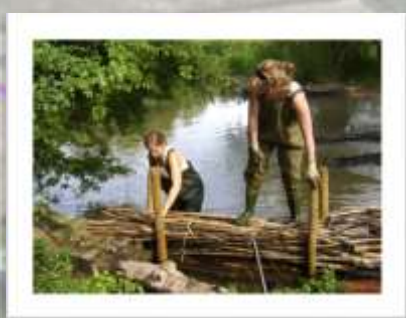
River bank repaired, mainly by volunteers