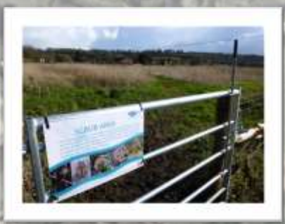
New fencing and gates installed, old fencing removed.