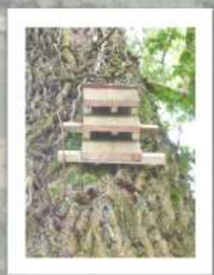
Bat & bird boxes installed