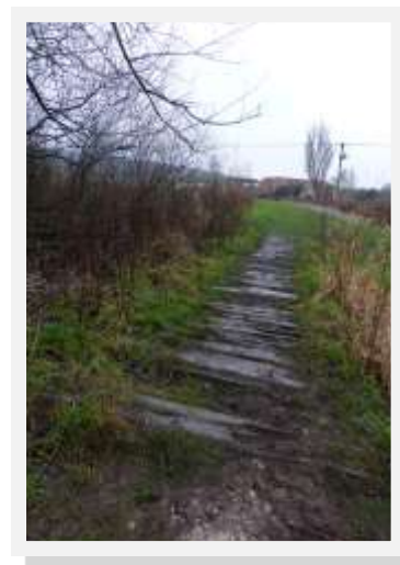
Footpath near Poulton Bridge to be repaired