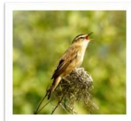
Sedge Warbler in scrub area

Actions: The footpath at Poulton Bridge requires repair where old sleepers have rotted and broken. ARK and MTC to assess cost and secure funding for this during 2015. ARK will investigate and explore ways to fund new closing mechanisms for the kissing gates to allow people to enter the field at the same time as the livestock.