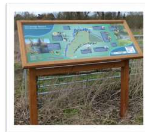
Interpretive panels provide information